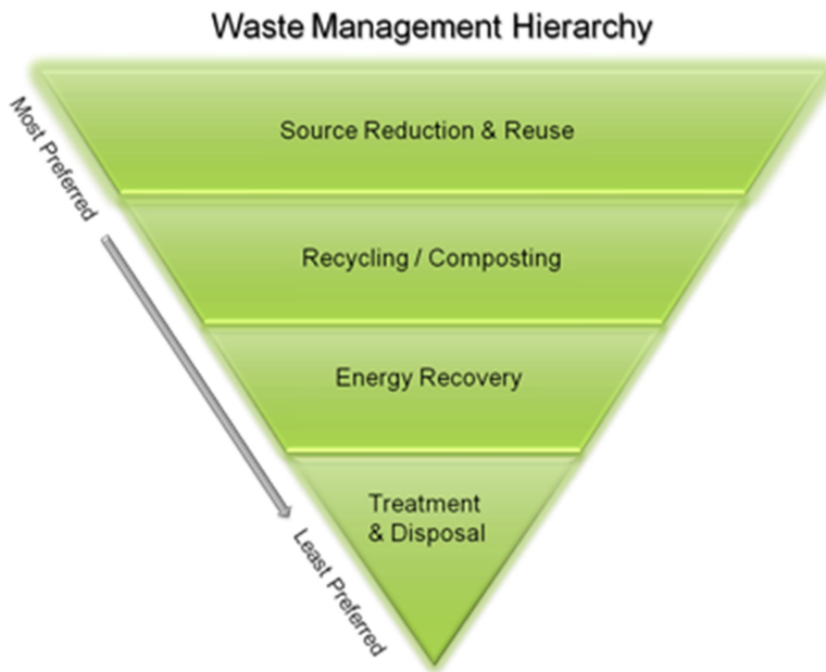
Figure 2. USEPA Waste Management Hierarchy

environmentally preferred method of managing waste 1 (Figure 2). Therefore, there are no unusual circumstances that would lead to a significant impact due to the ordinance.